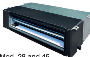
Mod. 28 and 45